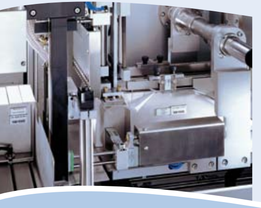
Folding and closing station