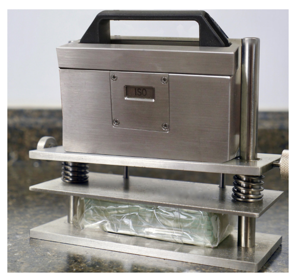
ISO Phenotest in progress