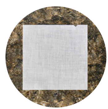
2" x 2" Crocksquare