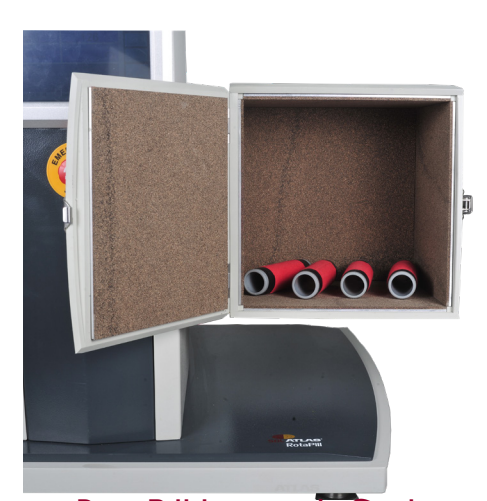
RotaPill box with Cork Linings and Sample Tubes