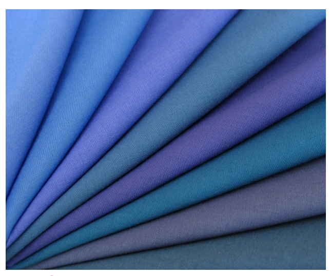
Lightfastness Test Materials