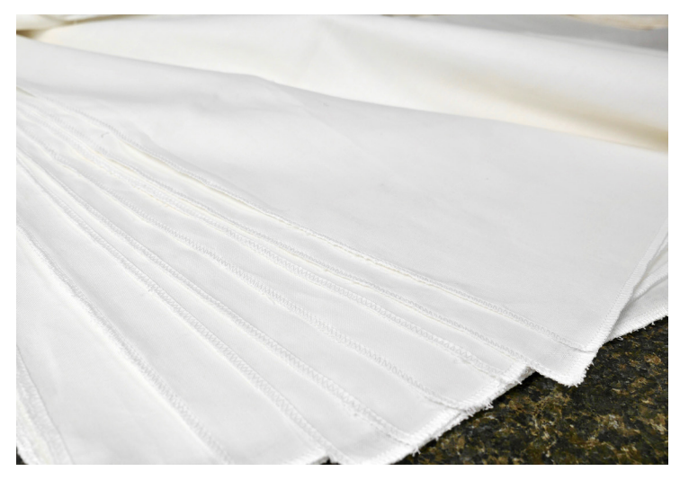
Specialty Cut Fabrics