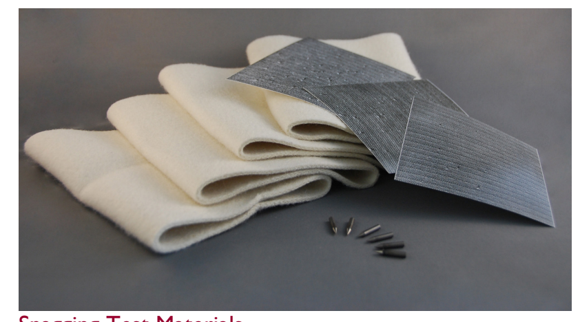
Snagging Test Materials