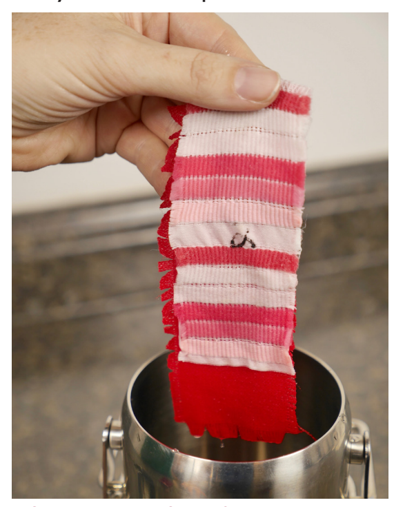
Stained Multifiber from Rotawash Container

Our DW and LW multifiber meet international and retailer standards and have been accepted by labs as an equal to other existing brands.