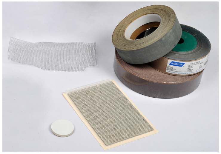
Universal Wear Tester Testing Materials