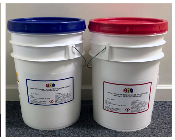
ECE and AATCC Detergents