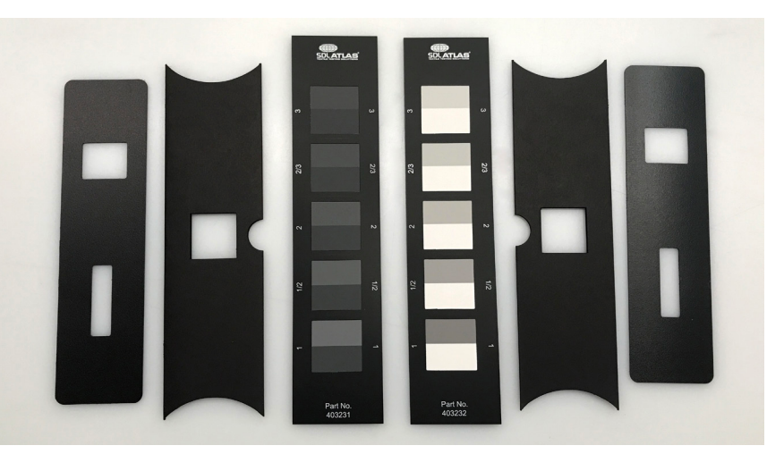
Gray Scales for Staining and Color Change