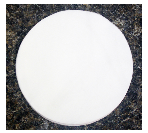
Burst Tester Verification Fabric

In addition to the items specifically mentioned here, SDL Atlas provides the most diverse variety of Test Material available from a single source. These pages show just a small sampling of what else we offer. For more information on SDL Atlas Test Materials, or to request a quote, contact an SDL Atlas solutions expert today.