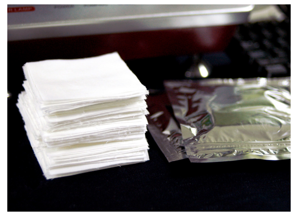
MMT Control Fabric