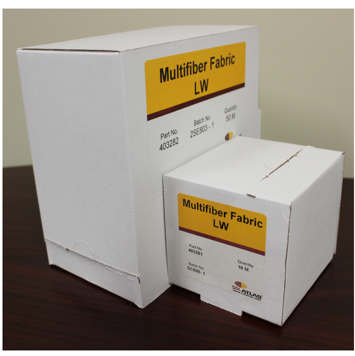
Multifiber by the Roll is packaged in specially designed dispenser boxes for ease of use and to protect the product