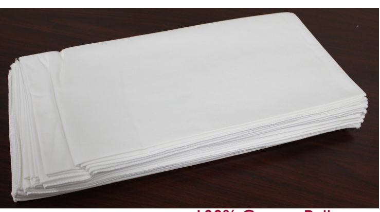
100% Cotton Ballasts