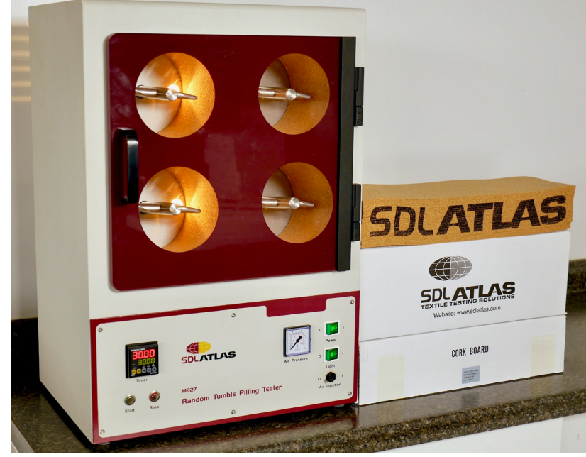
Random Tumble Pilling Tester with Cork Liners