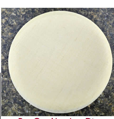
Pre-Cut Abradant Disc