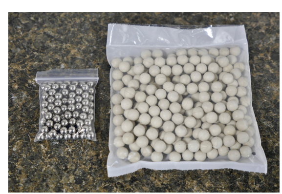
Ball Bearings for Colorfastness Testing