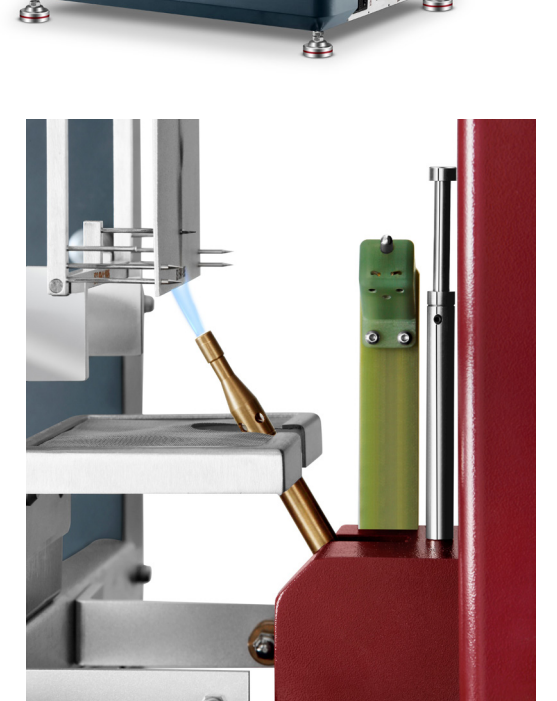
30° Bottom Flame Configuration

Most popular standards and routines are preprogrammed into the software