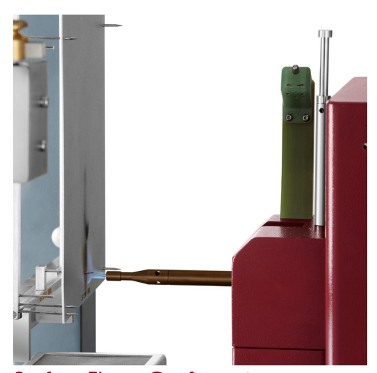
Surface Flame Configuration