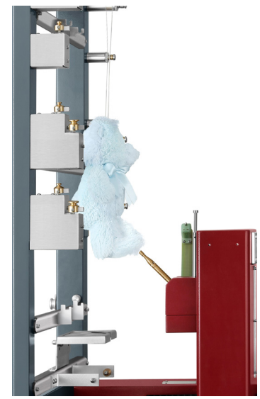
EN 71-2, section 5.3